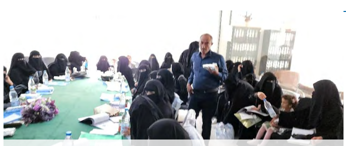
Part of training over 600 polio village volunteers in both the northern and southern governorates of Yemen

In 2017, an initiative under the name Polio Village Volunteers (PVV) was launched in Yemen to help involve the community in AFP surveillance. Then and there, EMPHNET trained PVVs from all parts of the country, expanding community engagement toward strengthening surveillance. Building on the success of this initiative, another collaboration was initiated in 2023 to scale up the role of PVVs to further strengthen VPDs surveillance and improve immunization coverage in hot zones in the country.