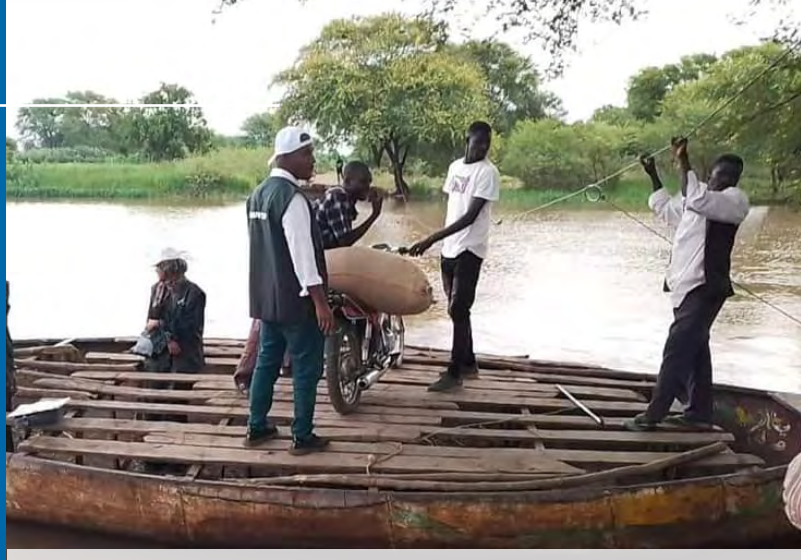
Sudan FETP residents conduct a community assessment for public health emergency response in areas affected by rainfalls (Al Rahad, Al Gadarif State)

Role of FETPs in Health Systems Strengthening: Opportunities and Challenges