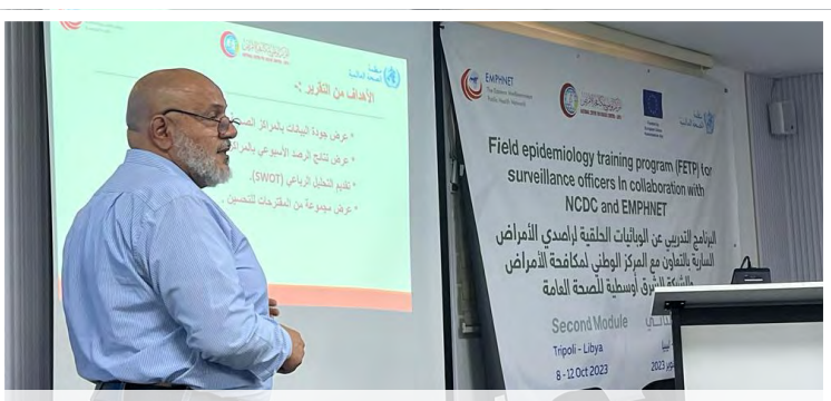
Libya's FETP enhances the surveillance capacity of health workers at the national level.