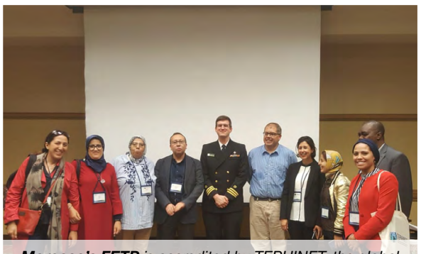
Morocco's FETP is accredited by TEPHINET, the global FETP network.