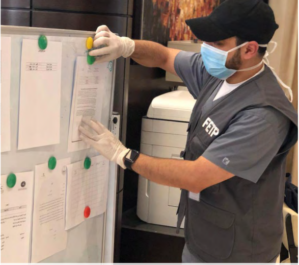
Saudi Arabia's FETP is the to be established in the EMR and is renowned for providing critical epidemiological support during Hajj season.