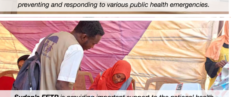
Sudan's FETP is providing important support to the national health system in the current humanitarian crisis.