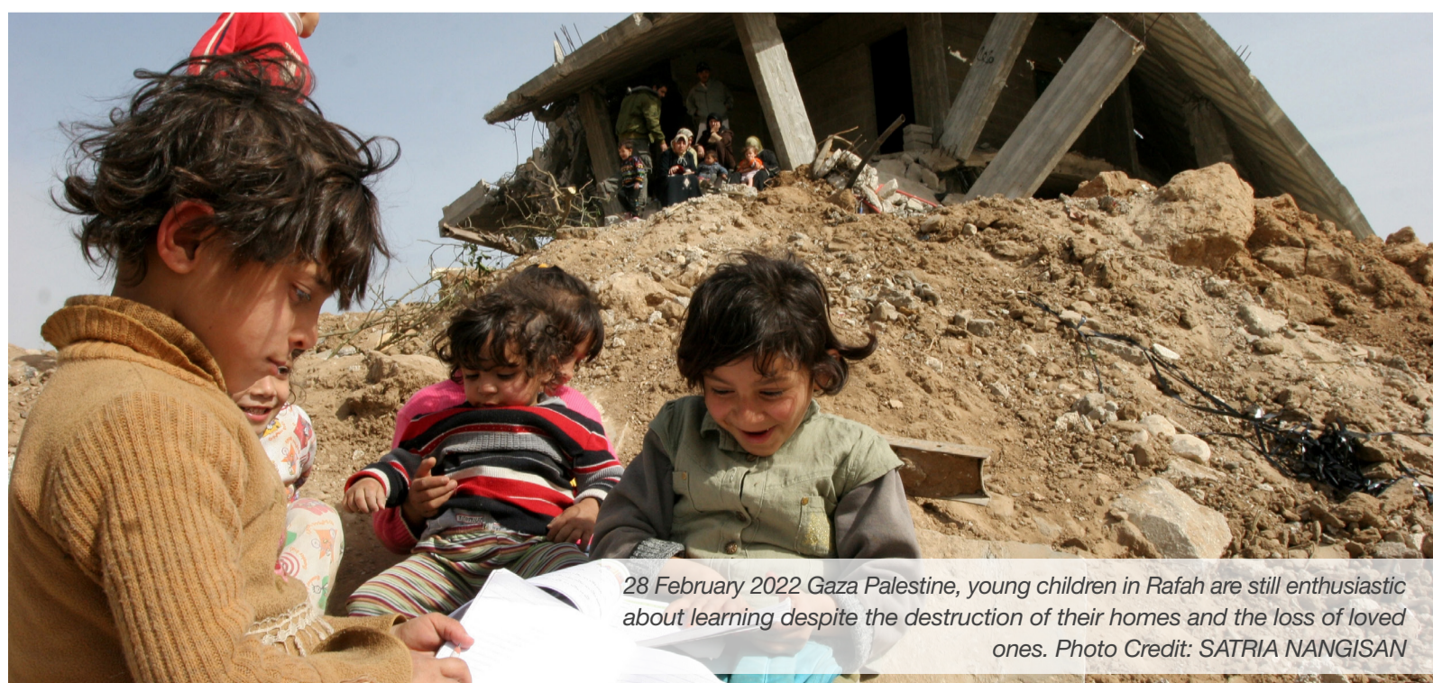
28 February 2022 Gaza Palestine, young children in Rafah are still enthusiastic about learning despite the destruction of their homes and the loss of loved ones.