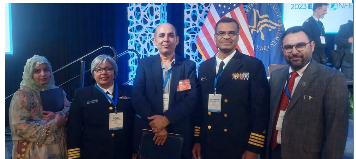
This event offered a space for FETP residents and EIS officers to exchange ideas, to share the work done by FETPs around the world, and to recognize the impact made by these programs in public health. It also provided a forum for FETP residents to give scientific presentations, and to increase their knowledge about surveillance and outbreak investigations.

The Training Programs in Epidemiology and Public Health Interventions Network (TEPHINET), and the CDC co-organized the 2023 Field Epidemiology Training Programs (FETP) International Nights in-person during the EIS conference on April 25- 26, 2023. These International Nights are organized as a part of CDC’s commitment to global health for 20 years.