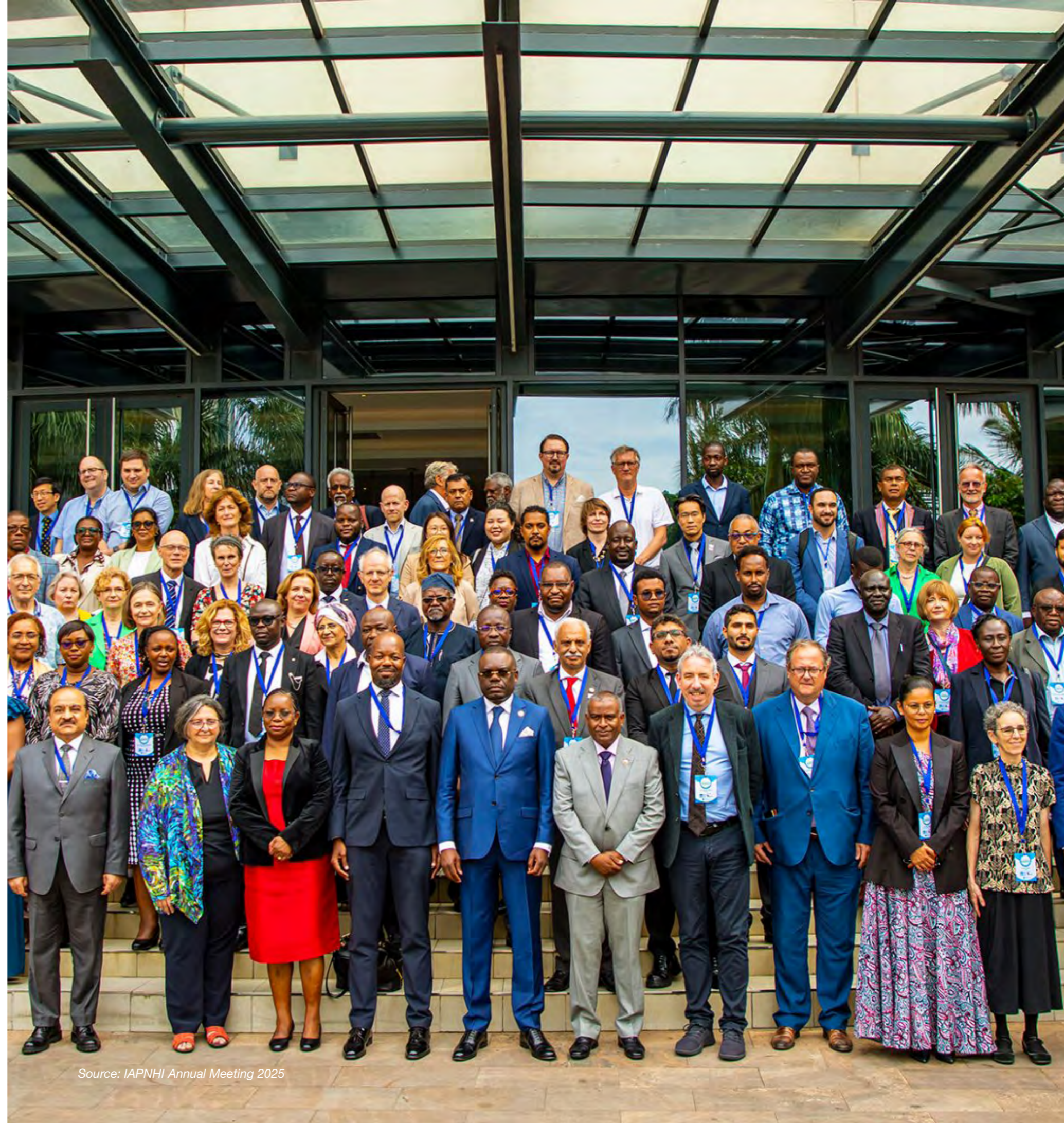
Source: IANPHI Annual Meeting 2025