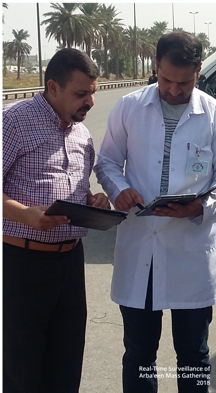
Real-Time Surveillance of Arba'een Mass Gathering 2018

GHD|EMPHNET works with over 15 countries in the EMR and collaborates with partners from the region