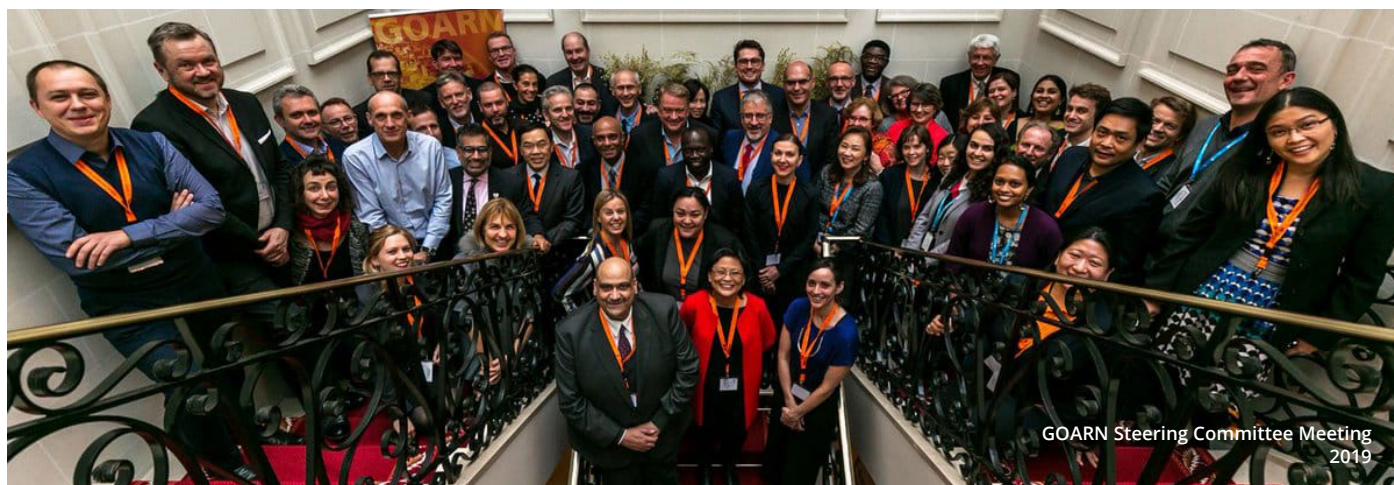
GOARN Steering Committee Meeting 2019

Further responding to the needs of the region and adhering to advancements in digital technology, GHD|EMPHNET has also reflected its networking efforts online thus launching its own networking platform early 2018 "EpiShares". Today, EpiShares serves as an online platform dedicated to public health professionals. It offers a virtual community for FETP residents and graduates, as well as public health experts from the region and across the globe to share knowledge, experiences, and ideas that could elevate their work. EpiShares provides its members with the opportunity to share posts relevant to public health issues. It also allows members to interact with such posts and create groups on specific areas of interest, among other features.