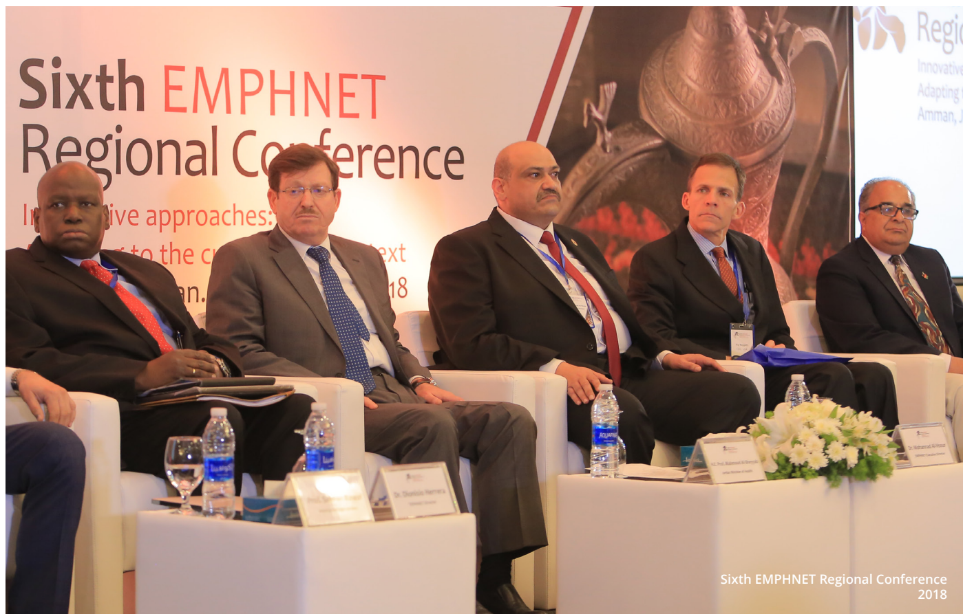
Sixth EMPHNET Regional Conference 2018

networking efforts allows us to integrate capacities when assisting countries to explore solutions for meeting the challenges. GHD|EMPHNET remains committed to network regionally and globally in order to attract opportunities and partnerships that support investment in programs that support implementation of the SDGs. We take pride in collaborating with Ministries of Health, and partnering with Regional and International organizations, as well as private sector and academic institutions.