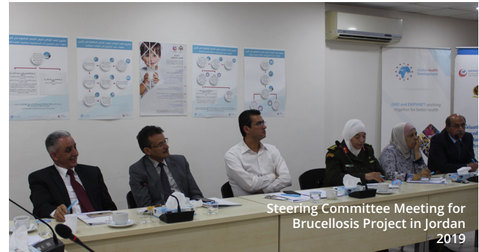
Steering Committee Meeting for Brucellosis Project in Jordan 2019

GHD|EMPHNET implemented activities to support strengthening of public health systems in EMR countries. Through collaborative efforts with partners and cooperation with ministries of health, GHD|EMPHNET managed to reach a status that is recognized at the regional and global levels. Our commitment to the region together with the increased trust and assertion from the countries helped us build a strong portfolio, made possible with an interconnected effort that continues to nurture and foster merit for better health to people living in the EMR.