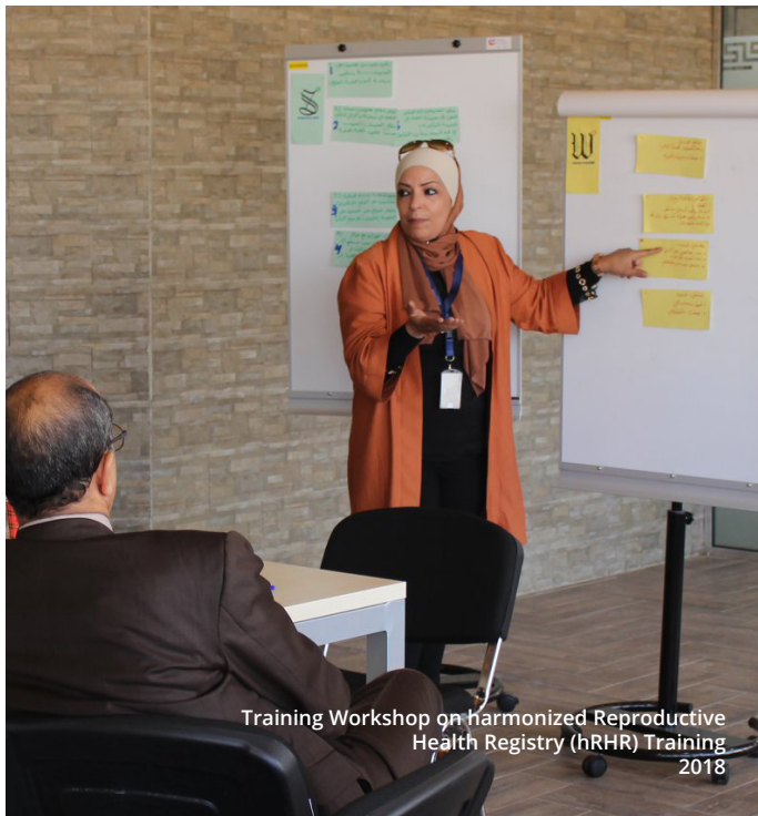
Training Workshop on harmonized Reproductive Health Registry (hRHR) Training 2018