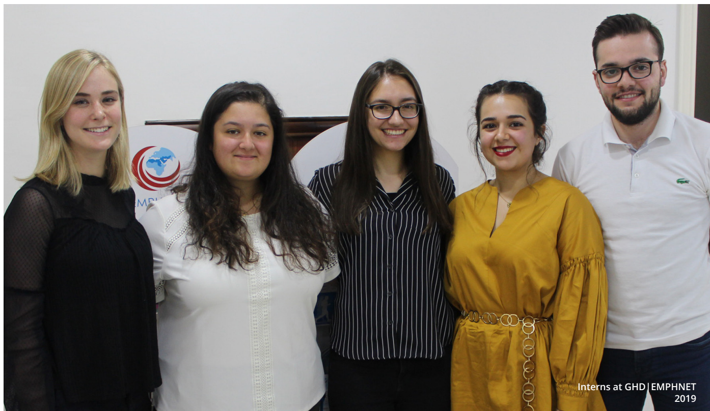
Interns at GHD|EMPHNET 2019

At GHD|EMPHNET, we match the career interest and preference of interns with work situations that allows them to maximize the use of the knowledge they gained during school education. We respect and encourage interns to be self-motivated while bearing responsibility to their own learning. Our internship program is in high demand with candidates seeking experience in different areas, including infectious diseases, applied epidemiology, health promotion, media and communication, and more. We admit interns who are highly committed to public health, hard workers, focused, with the ability and willingness to engage in different public health activities.