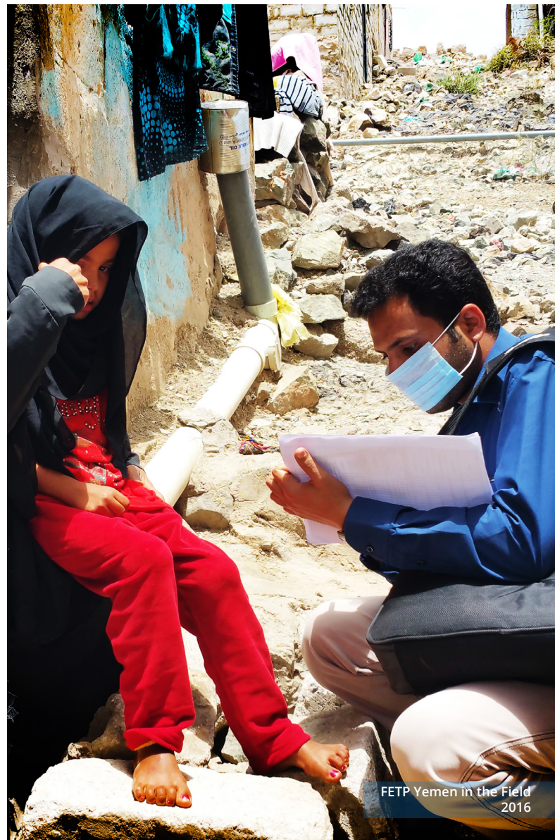
FETP Yemen in the Field 2016