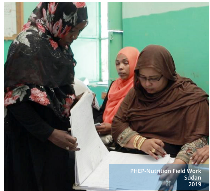
PHEP-Nutrition Field Work Sudan 2019

FETP training plays a crucial role in strengthening the response to unexpected health problems or events, thus containing and preventing their spread. Today, we work on integrating applied epidemiology concepts in strengthening a range of services as we believe that skilled field epidemiologists are core to a robust public health system.