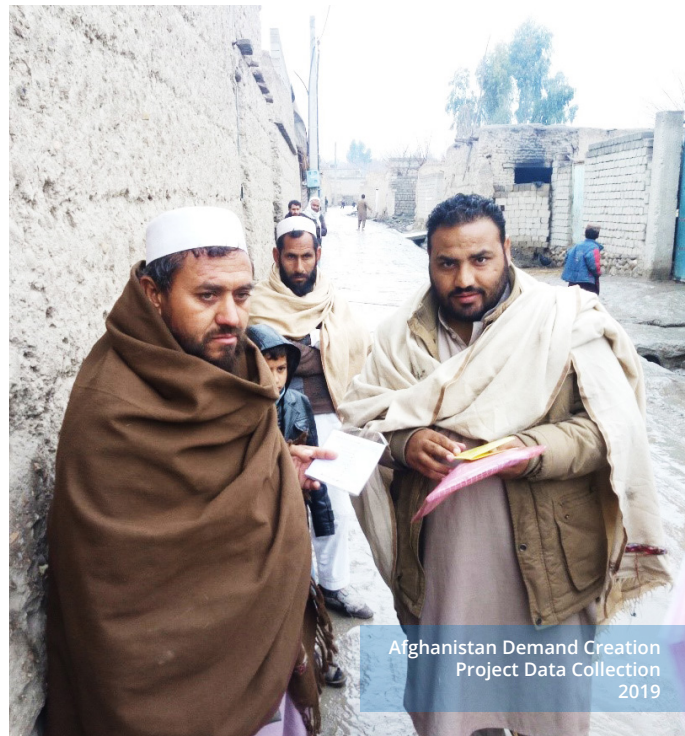
Afghanistan Demand Creation Project Data Collection 2019