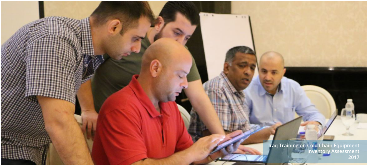
Iraq Training on Cold Chain Equipment Inventory Assessment 2017

that cover targeted public health areas, such as outreach and emergency, biorisk management, communicable diseases, and health protection and promotion. Our vision is to see people in the Eastern Mediterranean Region lead healthy lives and well-being. We aim to achieve our mission by working in four areas: Workforce Development, Public Health Programs, Research and Policy, and Communication and Networking.