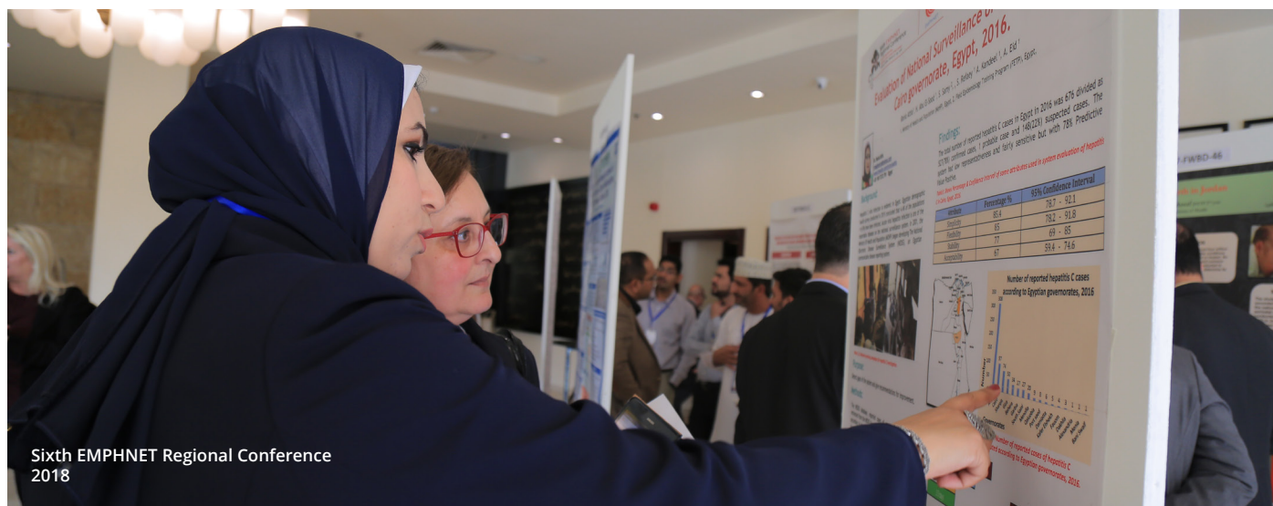
Sixth EMPHNET Regional Conference 2018