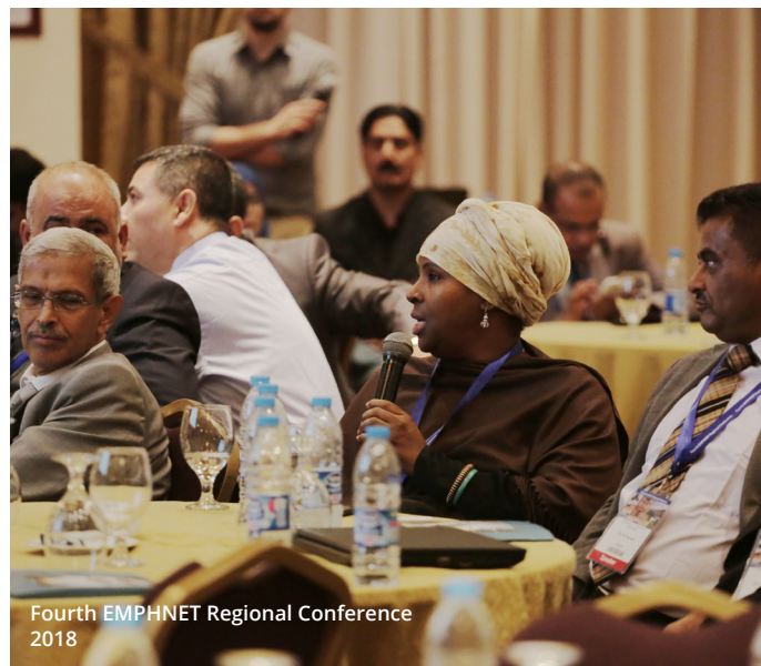
Fourth EMPHNET Regional Conference 2018

To date, we have conducted six regional conferences, where over 1,000 scientific pieces of work were presented. The number of submissions and accepted abstracts to GHD|EMPHNET conferences escalated over the years, making such conferences recognizable with a competitive pursue.